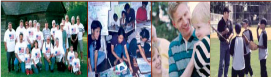
FAITH COMMUNITY FAMILY YOUTH FELLOWSHIP

The Knights of Columbus is an organization fortified by its past, and driven by its goals for the future. It's through these five areas of service—faith, community, family, youth, and fellowship—that we truly make a difference.