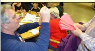
"Cash prizes in the pink envelopes"