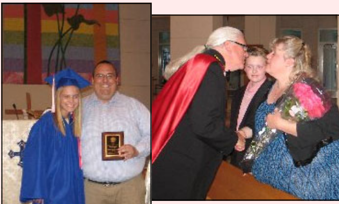
(Winning Application on page 5)