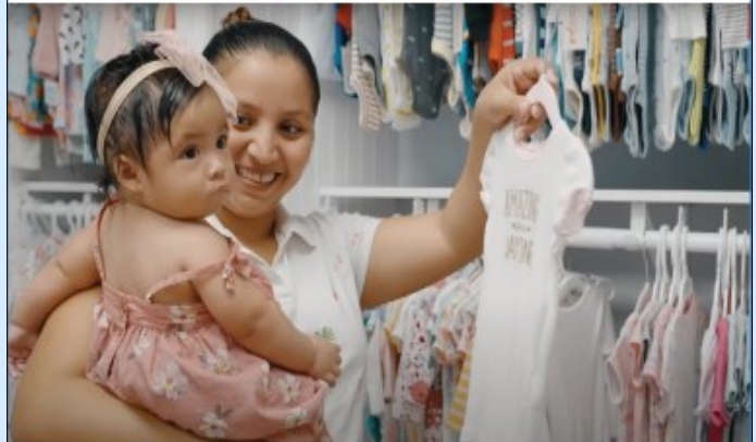
A client of Loving Choice Pregnancy Help Center picks out a garment for her daughter from the center's clothing boutique.

The grand knight of St. Clare of Assisi Council 9708 in Houston contacted Loving Choice Pregnancy Help Center last year with a simple question: “What can we do?” Before long the Knights were helping the center expand its space by about 50%, a project recently recognized with an International Program Award. WATCH HERE