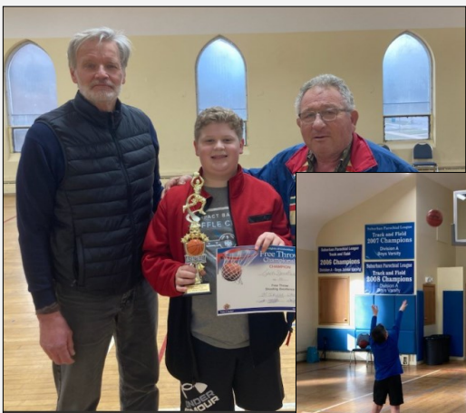
Tom Nemo Council 6710 Free Throw